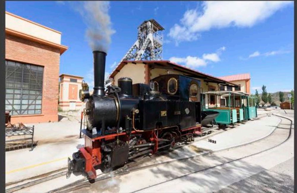
"Hulla" steam locomotive (1903)

Here you can enjoy different buildings linked to the Pit of Santa Barbara mine.