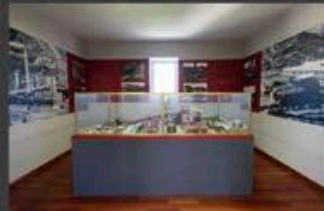
Inside Mining Museum of Utrillas