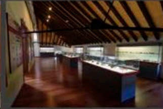
Inside Mining Museum of Utrillas