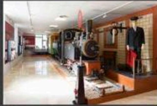
Inside Mining Museum of Utrillas