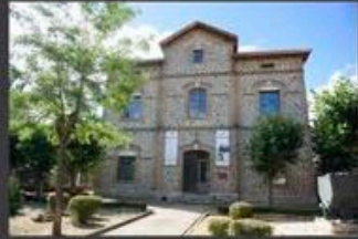
Frontage of Mining Museum Utrillas