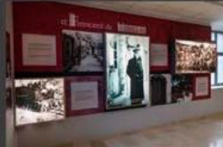
Inside Mining Museum of Utrillas