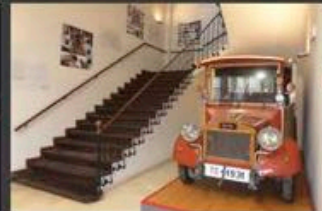
Inside Mining Museum of Utrillas

The building was built in 1920 to set up a mining convent-hospital. It was directed by the Sisters of Charity of St. Vincent of Paul. The entrance and stairs of it are original.