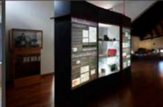
Inside Mining Museum of Utrillas