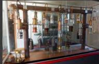
Inside Mining Museum of Utrillas