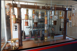
Inside Mining Museum of Utrillas