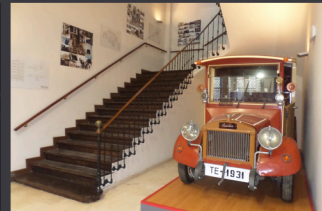
Inside Mining Museum of Utrillas

The building was built in 1920 to set up a mining convent-hospital. It was directed by the Sisters of Charity of St. Vincent of Paul. The entrance and stairs of it are original.