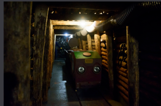
Inside recreation of Utrillas Mine