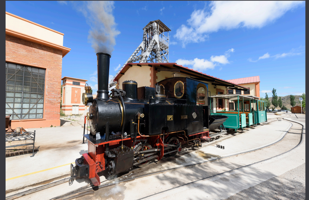
"Hulla" steam locomotive (1903)

Here you can enjoy different buildings linked to the Pit of Santa Barbara mine.