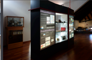
Inside Mining Museum of Utrillas