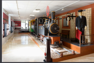
Inside Mining Museum of Utrillas