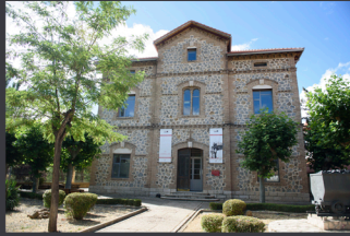
Frontage of Mining Museum Utrillas