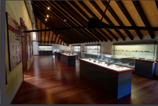
Inside Mining Museum of Utrillas