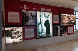
Inside Mining Museum of Utrillas