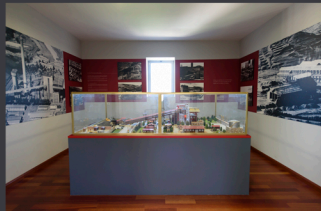
Inside Mining Museum of Utrillas